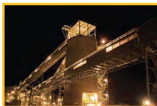
Debswana Jwaneng Cut 8 Diamond Mine Expansion - EPCM Client: Debswana Diamond Company Location: Botswana

We offer solutions to Clients in the following areas: alumina and bauxite, coal, copper, diamonds, gold, iron ore, mineral sands, nickel, oil sands, uranium and other metals. Fluor also provides complete life-cycle services to Clients in the downstream metals market.