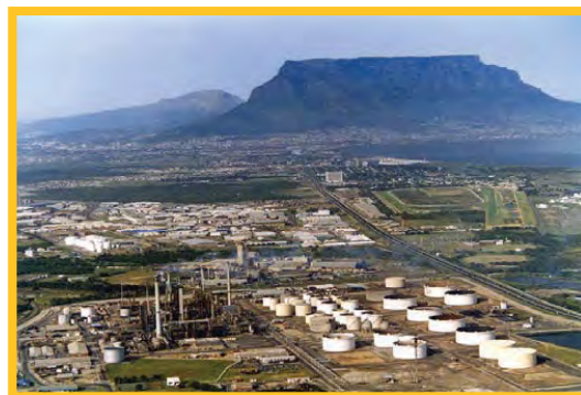
Caltex (now Chevron) Grassroots Oil Refinery - EPC Client: Caltex Location: Cape Town, South Africa

Fluor began executing projects in the energy and chemicals sector in southern Africa more than 50 years ago with projects for Sasol and Caltex. Additional projects in this market solidified Fluor's reputation in South Africa that led to significant new work in the region.